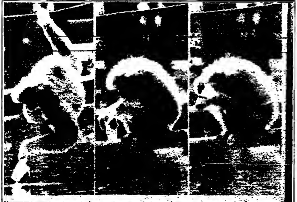
WELL IMITATED: This black gibbon of a Munich zoo imitates humans in having a drink. While balancing out on his bamboo perch, the gibbon angles for water with a little cup (left), then lifts the cup with both arms onto the bamboo perch (center) and finally is able to enjoy the drink.

position the Germans have stated publicly all along. In a related development, Portuguese Foreign Minister Andre Concalves Pereira met with Secretary of State Alexander Haig Wednesday for talks focusing on East-West issues and Portugal's importance in the NATO alliance. Meanwhile, Moscow's sharpest attack yet on the Reagan government is seen by Western analysts as a sign of Kremlin frustration over what it regards as U.S. attempts to expand influence in West Europe.